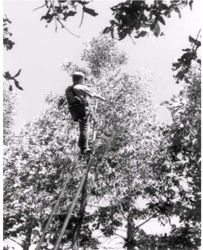
Figure 4 - Form Pruning from a ladder.