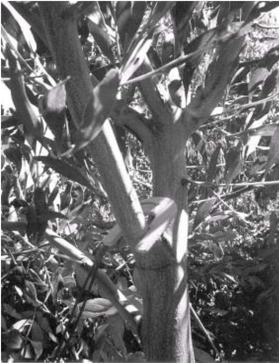
Figure 1 - Pre form pruning