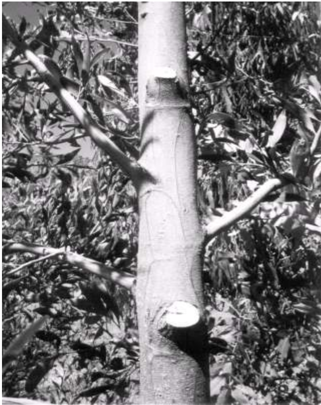
Figure 3 - Removal of large branches.