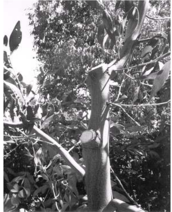
Figure 2 - Post form pruning

The gauge can be seen in Figure 1. This gauge is made from plywood, with 18mm and 25mm gaps. In Figure 1, three competing leaders can be observed above the gauge. Of these, the dominant leader was chosen as that on the right. Figure 2 shows the completion of form pruning, with all undesirable competing leaders removed. The diameter of the retained leader is ~20mm. As competing leaders have been removed at a relatively small size, the retained leader will straighten as growth continues. At the next pruning operation in 12 months time the stem should be nearly straight, with only a slight stem kink. Form pruning continues annually until a straight stem of the desired length is produced.